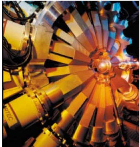
GAMMASPHERE is one of the forefront instruments available for experiments at ATLAS. It consists of 110 Compton-suppressed Ge detectors used to detect gamma rays emitted from compound nuclei formed by fusion of accelerated heavy ions and target nuclei.

ATLAS provides beams and experimental instruments for a large community of nuclear scientists. In 2006, there were 436 active users, including 75 graduate students. Typically, research at ATLAS results in 10 Ph.D. theses and 60 publications in peer reviewed scientific journals every year. Beam time is allocated based on the recommendations of a Program Advisory Committee which meets twice a year.