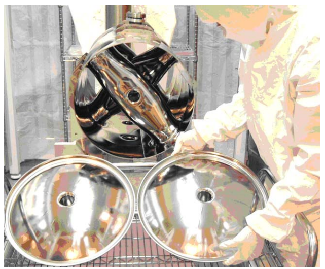
Figure 2: Niobium elements of the prototype superconducting \beta_G=0.50 triple-spoke cavity after electropolishing and just prior to welding the complete assembly.

RIA driver, when compared to the measured average performance of the elliptical cavities built for the SNS, they would provide the same voltage gain with similar cryogenic power requirement while eliminating the need for 2 K operation and reducing the number of cavities. The anticipated very low level of microphonics was also confirmed, thus reducing the amount of rf power required for phase and amplitude stabilization.