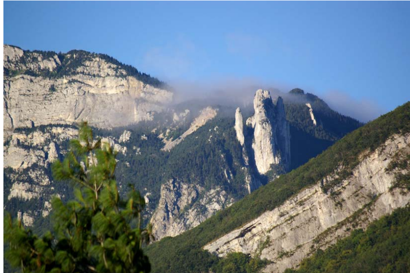
The "three maidens" rocks with, the Moucherotte behind.

For those willing to make some sport, depending on the number of participant (20 is ideal), a third coach will drive you to 1000 metres altitude where you will start a 3-4 hour roundtrip trekking to reach the top of a mountain facing Grenoble valley. Your climbing effort will be rewarded by a beautiful view of the Alps Chain and the Grenoble valley beneath. This option strongly depends on the weather condition and requires a reasonable health condition of the participants. Good walking shoes are required, along with hot clothes in a bag, just in case.