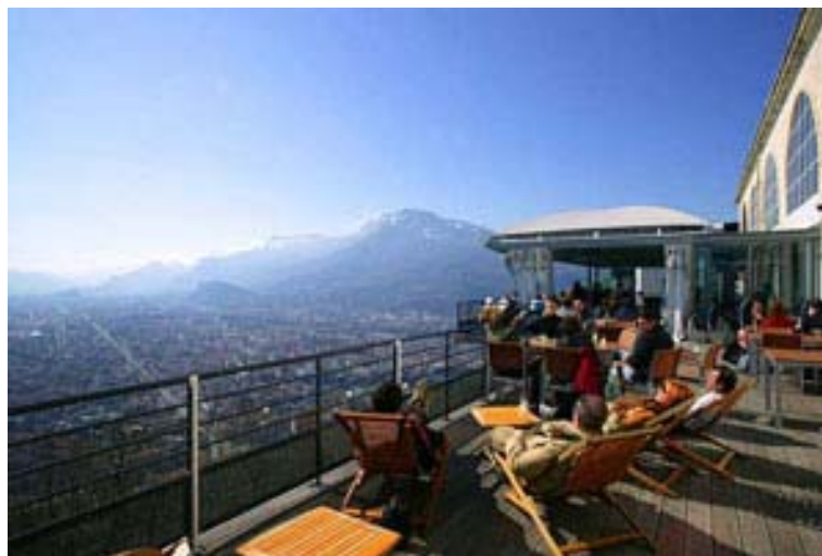
Panoramic view from one of the Bastille Fort restaurants. The Moucherotte mountain is behind.