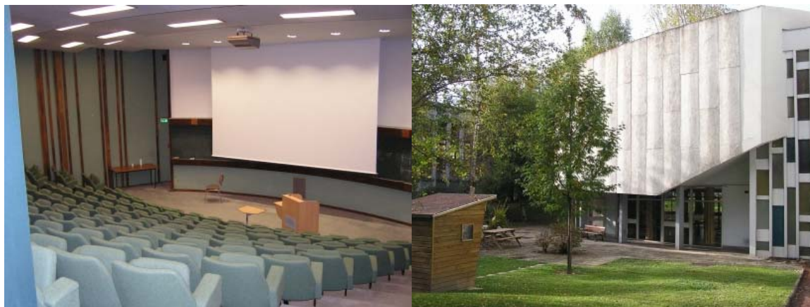
LPSC amphitheatre (left). Cafeteria located directly under the amphitheatre (lunches).

The LPSC amphitheatre is equipped with a large video screen and projector and offers WIFI connection to participants. A computer room will be installed close to the amphitheatre. Posters will be installed directly in the hall in front of the amphitheatre doors.