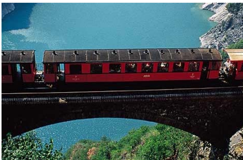
The train of La Mure

http://www.trainlamure.com/pages/en/6/chemin-de-fer-de-la-mure.html