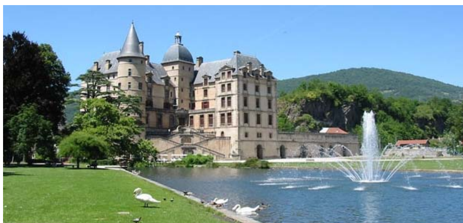
The Vizille castle, where the French revolution really began...

http://www.musee-revolution-francaise.fr/Index.html