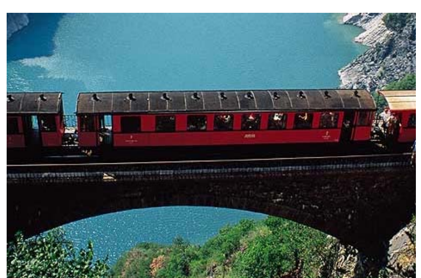
The train of La Mure

http://www.trainlamure.com/pages/en/6/chemin-de-fer-de-la-mure.html