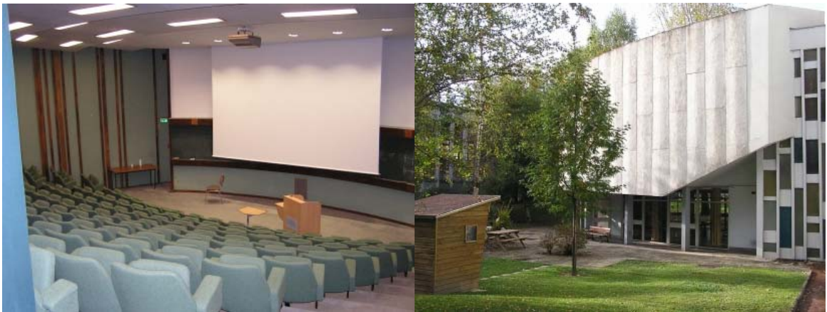
LPSC amphitheatre (left). Cafeteria located directly under the amphitheatre (lunches).

The LPSC amphitheatre is equipped with a large video screen and projector and offers WIFI connection to participants. A computer room will be installed close to the amphitheatre. Posters will be installed directly in the hall in front of the amphitheatre doors.