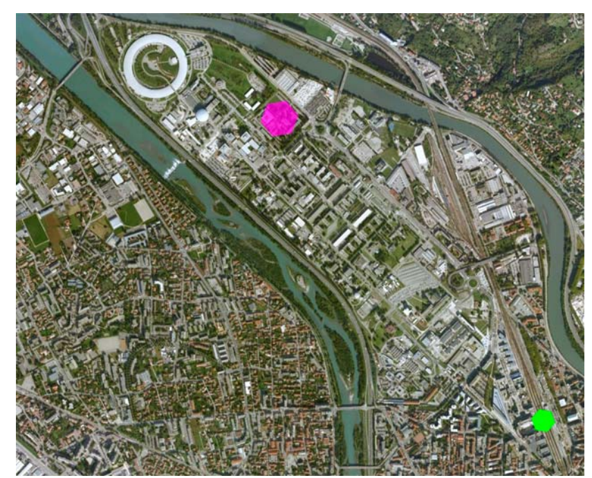
Location of LPSC (pink hexagon up left) and Grenoble train station (green hexagon down right).

The workshop will be held directly at the Laboratoire de Physique Subatomique et de Cosmologie (<u>http://lpscwww.in2p3.fr/</u>). LPSC is located at the north west of Grenoble in the Scientific Polygon area, very close to the ESRF synchrotron facility (see the ring on the picture). LPSC is located 2.5 km from the train station, where the main hotel offers are concentrated. The regular bus lines 30 (4 bus/hour) and 34 (6 bus/hour) drives you from the train station to the lab in 10 minutes. The ticket price is today 1.4 \in (or 11.2 \notin 10 tickets). It is possible to walk to the lab following the Isère river (consider 40 minutes to do so).