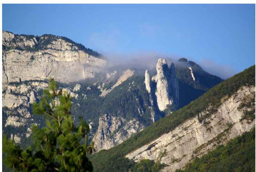
The" three maidens" rocks with, the Moucherotte behind.

For those willing to make some sport, depending on the number of participant (20 is ideal), a third coach will drive you to 1000 metres altitude where you will start a 3-4 hour roundtrip trekking to reach the top of a mountain facing Grenoble valley. Your climbing effort will be rewarded by a beautiful view of the Alps Chain and the Grenoble valley beneath. This option strongly depends on the weather condition and requires a reasonable health condition of the participants. Good walking shoes are required, along with hot clothes in a bag, just in case.