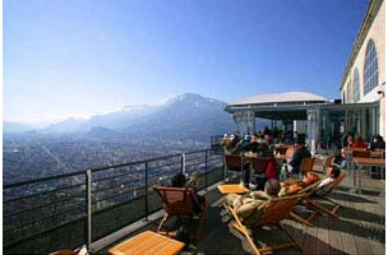
Panoramic view from one of the Bastille Fort restaurants. The Moucherotte mountain is behind.