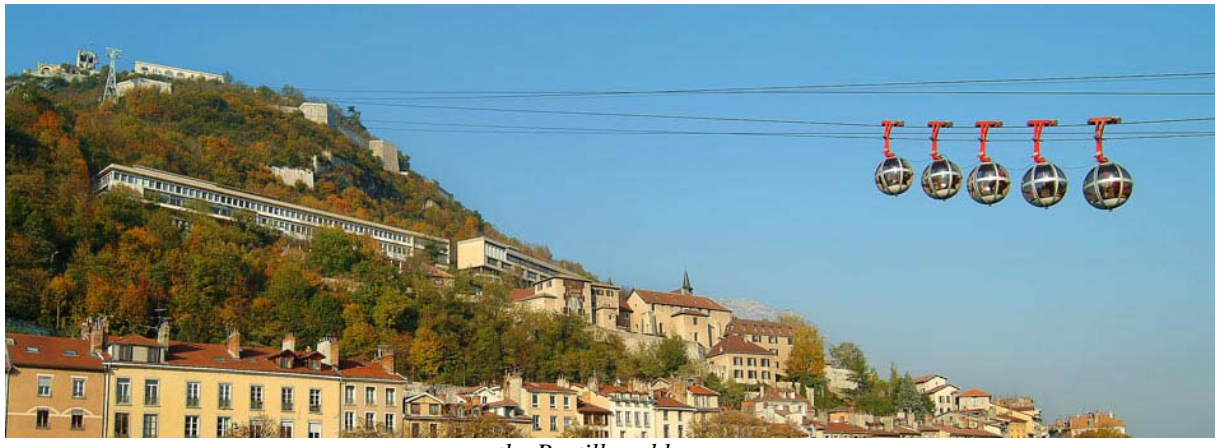
the Bastille cable car

The banquet should be organized in the Bastille Fort, located 250m above the Valley. The restaurant offers a panoramic view over the city. You can either climb by foot to the restaurant or use the "Télépherique" (cable car) to reach the fort.