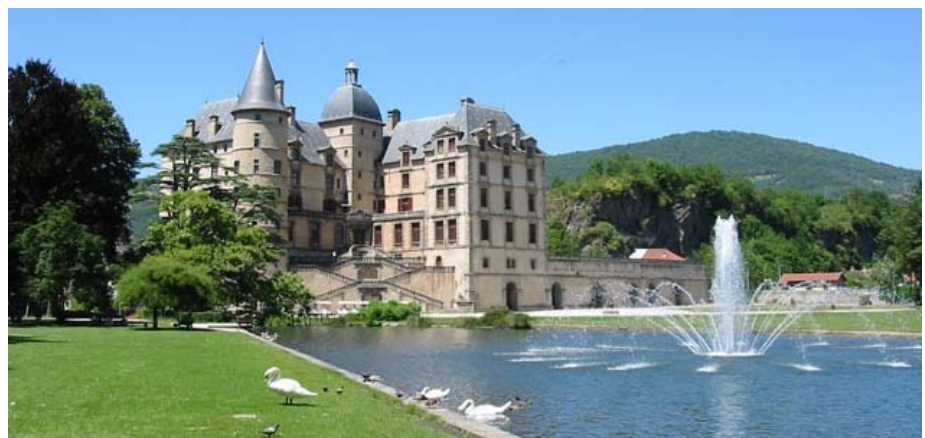
The Vizille castle, where the French revolution really began...

http://www.musee-revolution-francaise.fr/Index.html